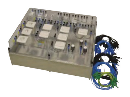
Household panel + set of leads